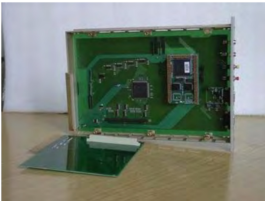
Figure 2: CAMAC crate-controller, developed and made in KCSR.