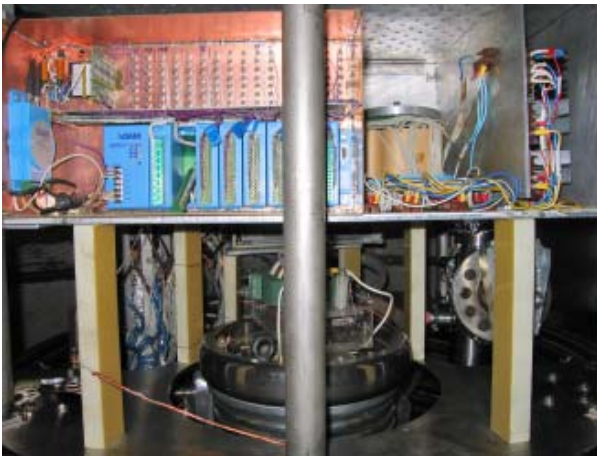
Figure 1: High voltage terminal.