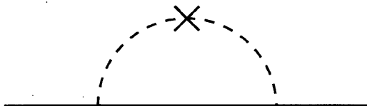
Figure 2: Gluino contribution to the \theta -term.

But before of that we wish to mention the following circumstance. Let us consider, instead of the vertex part (Fig. 1), the corresponding mass operator (Fig. 2). This contribution to the CP -odd \gamma_5 -mass of a quark, or to the induced \theta -term, is enormous. It exceeds by 6 – 7 orders of magnitude the upper limit on \theta [7, 8] following from the neutron EDM experiment. This situation is quite common to models of CP -violation. As common is the argument, according to which there should be some mechanism, for instance the Peccei-Quinn one, which makes the \theta -term harmless, which allows to transform it away. We will also adhere to this conservative point of view.